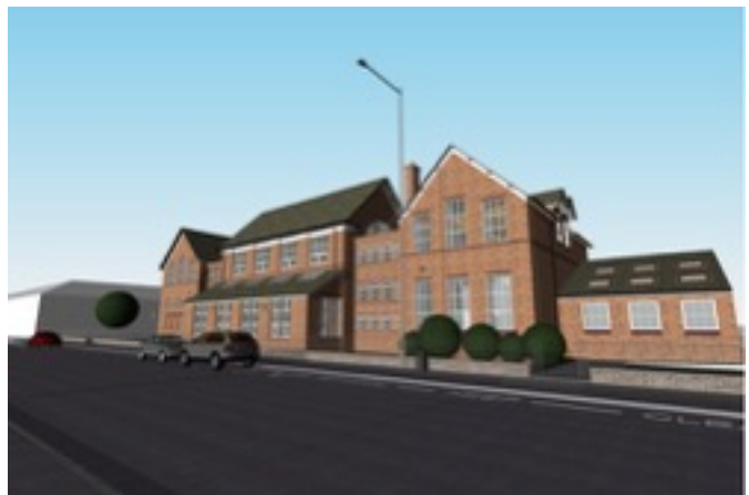
The building now, and as proposed