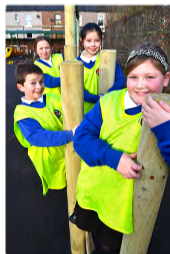
Playground Leaders are doing a fantastic job helping younger children enjoy the playground.