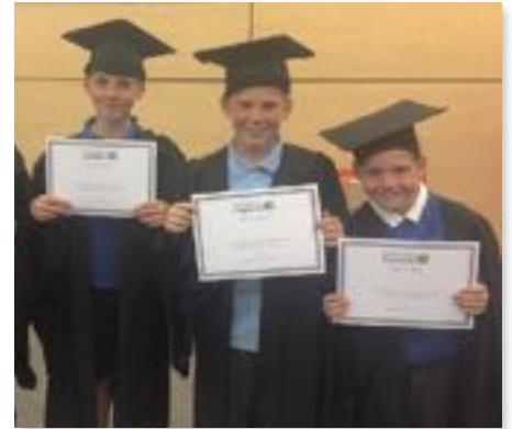
Learning for Life: A visit to University of Cumbria

“Knowledge is changing so fast that we cannot give young people what they will need to know, because we do not know what it will be. Instead we should be helping them to develop supple and nimble minds, so that they will be able to learn whatever they need to. If we can achieve that, we will have a world-class workforce comprising people who are innovative and resourceful.”