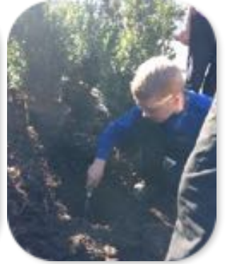
relevant at RFPS.

When children enjoy what they do, they learn better.