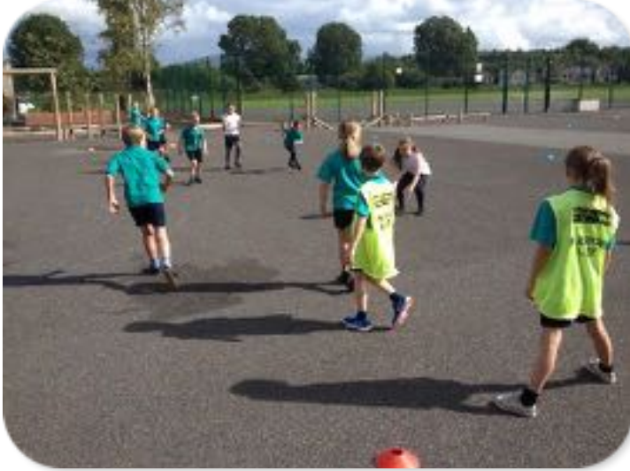
Playground leaders receiving training in organising playground games.