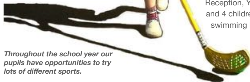
Throughout the school year our pupils have opportunities to try lots of different sports.

Competitive sports help pupils to grow in confidence, learning how to respond to disappointments with perseverance, and success with good grace. We enter inter-school competitions including cricket, football, gymnastics and athletics. Pupils have also participated in local dance events. At the end of the year we have a sports day in which all children can celebrate by competing both individually and as part of a team.