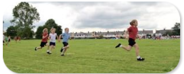
Our extensive playing fields are perfect for a broad range of sports.