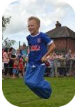
Learning is fun...

Pupils set challenging targets for their own learning and are encouraged to be ambitious.