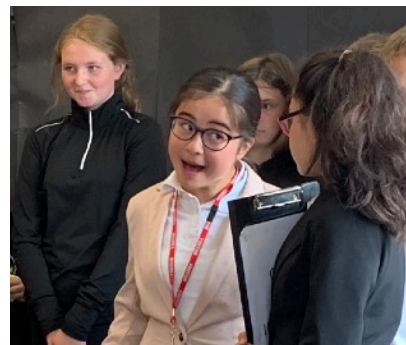
Above: Year 6 Business Enterprise Week and Year 6 drama performance